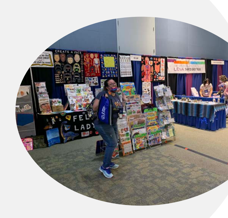
Exhibit Hall Schedule